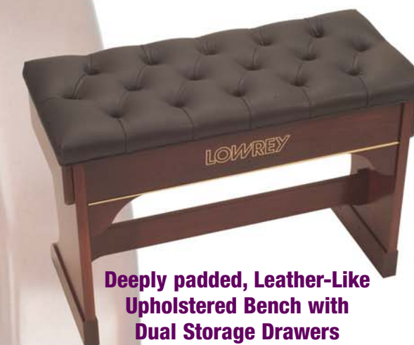
Deeply padded, Leather-Like Upholstered Bench with Dual Storage Drawers