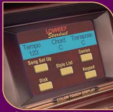
Color Touch Display